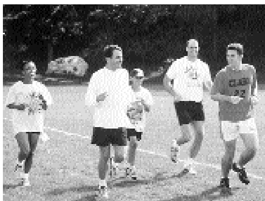
Alumni Fun Run

On September 29, 2001 more than 180 alumni athletes from six decades participated in the Inaugural Alumni Athlete Homecoming. There was a full day of alumni activities as well as intercollegiate games. Alumni activities included the fun run, softball, basketball, soccer, lacrosse and field hockey games. The day also included varsity events in which the field hockey team defeated WPI 8-0 and the men's soccer team defeated Lasell College 3-2 at Granger Field. Down the road at WPI, the women's volleyball team won the Worcester City Tournament and WPI defeated women's soccer 3-0. The day also included a barbecue lunch, post-game refreshments, a complimentary pass to the fitness center for the weekend, supervised kids activities, and a free T-shirt. The festivities concluded with Clark's eighth-annual Hall of Fame Induction Ceremony. "It was very