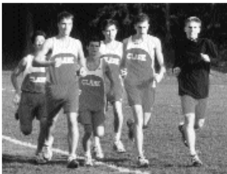
Men's Cross Country in Action