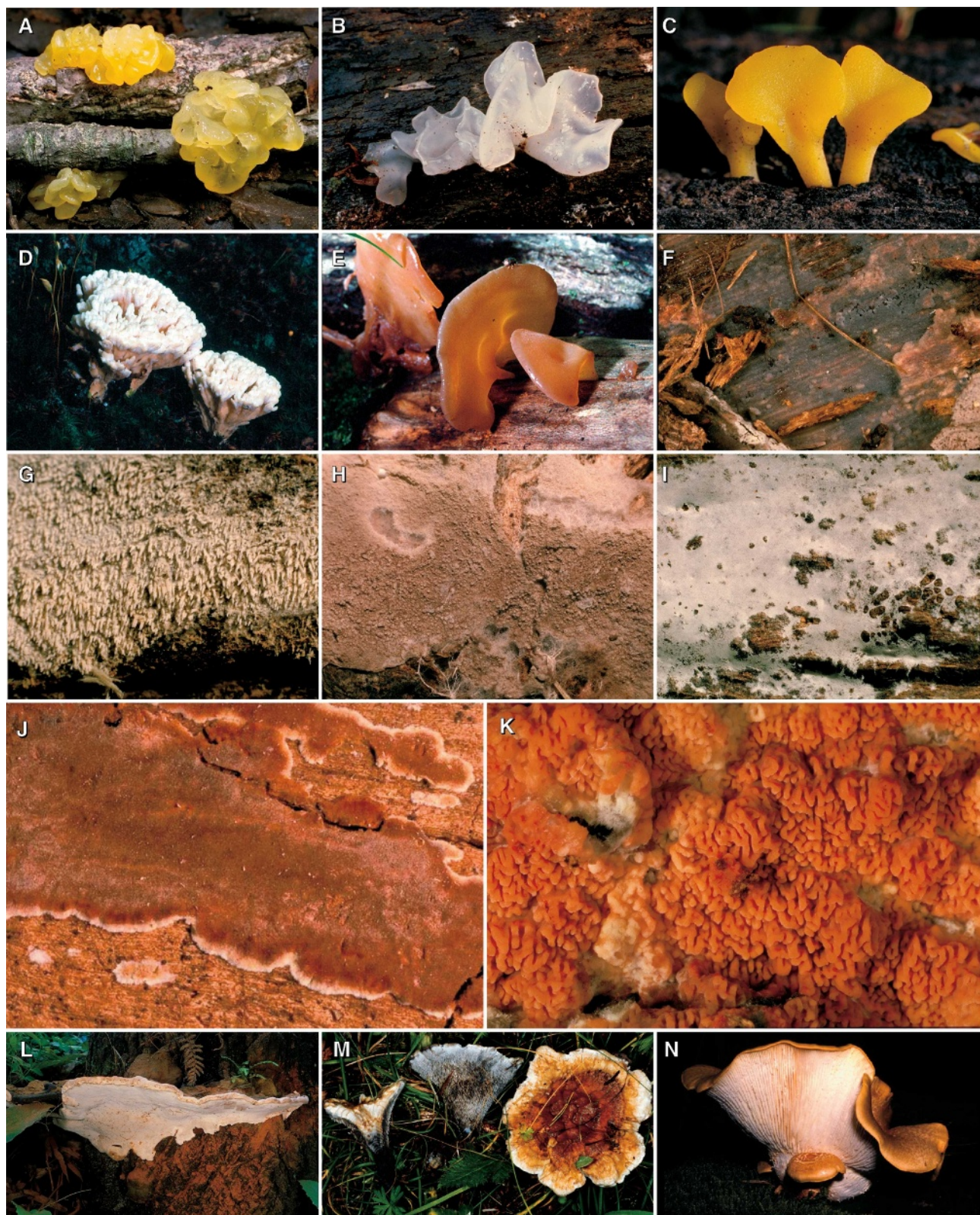
FIG. 1. Fruiting bodies of Agaricomycotina, emphasizing jelly fungi and resupinate forms. A. Tremella mesenterica (Tremellales). B. Tremella fuciformis (Tremellales). C. Dacryopinax spathularia (Dacrymycetales). D. Tremellodendron pallidum (Sebacinales). E. Auricularia auricula-judae (Auriculariales). F. Exidiopsis sp. (Auriculariales). G. Trechispora sp. (Trechisporales). H. Tomentella sp. (Thelephorales). I. Athelia sp. (probably Atheliales). J. Veluticeps sp. (Gloeophyllales).